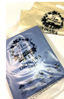
A cassava bag

As a souvenir for event participants, Okinawa Congrès Inc. offers the first sunscreen in Japan that does not negatively impact coral reefs. A portion of the income from sales is donated to coral transplant operations and ocean conservation efforts. Participants may also receive a bag made of cassava (the plant used to make tapioca). This makes the bag biodegradable.