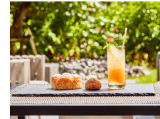
Sweets made using honey from Onna Village

Loisir Hotel Naha partly covers its energy requirements with water-soluble natural gas, a by-product of pumping hot spring water. This is a source of clean energy that helps to reduce CO 2 emissions.