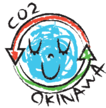
Okinawa's logo for offsetting carbon

The Okinawa Convention & Visitors Bureau supports the sustainability of local businesses by using the carbon credit scheme to offset carbon emitted during the production of congress bags*2.