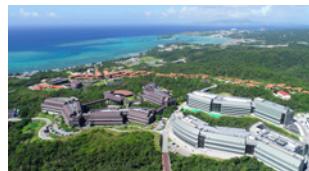
Okinawa Institute of Science and Technology Graduate University

At past international symposiums, OIST has collaborated with local sushi restaurants to provide sustainable seafood sushi and vegetarian sushi. This helps to conserve marine resources and caters to various religious and personal preferences.