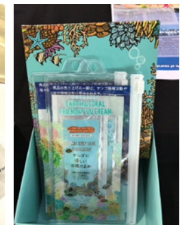
Sunscreen that does not negatively affect coral reefs