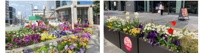
The "One Citizen, One Flower" Flower City project

The Fukuoka International Congress Center and the ACROS Fukuoka area are part of the All Fukuoka system, which unites citizens, companies, and the city government. This creates opportunities for engagement between members of the local community and participants in international conferences and incentive trips.