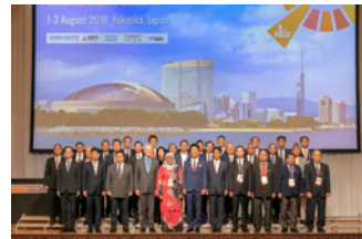
The 12th Asian-Pacific City Summit

This network has led to the overseas urban development of the “Fukuoka system,” a waste landfill technology. By way of the Asia-Pacific City Summit and cooperation with the UN-Habitat Fukuoka Office, Fukuoka is advancing the efforts of cities across the Asia Pacific region to achieve the SDGs.