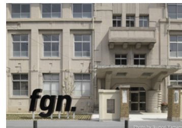
Startup support facility Fukuoka Growth Next

Fukuoka supports startups in various ways. One example is Fukuoka Growth Next, a public-private startup support facility that uses the school buildings of closed elementary schools. There's also a hands-on support program. These measures contribute to local economy vitality and create jobs.