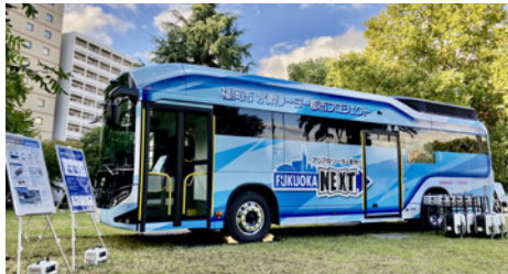
Mobile power generation and supply system "Moving e"

Kyushu University has one of the largest hydrogen-related research facilities in the world. The university is collaborating with industry as part of an effort to achieve a society based on hydrogen energy.