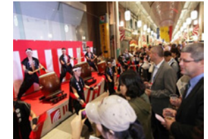
Kawabata Shopping Arcade

Fukuoka CVB offers programs that showcase Fukuoka’s customs and culture. Performances featuring Hakata spinning tops, for example, have over 470 years of history. Business event participants can also take part in a wide range of activities with an emphasis on sustainability. The “inclusive kimono experience” is an opportunity to try on hakama and kimono without conventional gender restrictions, and the “slow food experience” is a chance to savor local food.