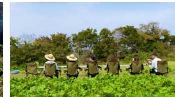
A harvesting experience promoting local production and local consumption