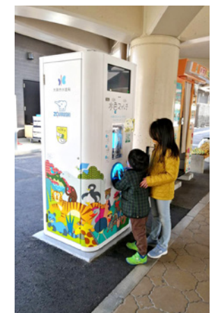
A water supply spot

The Osaka City Waterworks Bureau has installed permanent water supply points in six places, including Osaka Castle Park and other tourist sites. The goal is for people to fill reusable bottles with tap water, thus reducing plastic usage and contributing to the environment. The supply points use advanced water purification treatment to provide chilled, delicious tap water with moderate mineral content and no unpleasant taste or odor. Mobile supply points are also leased to event organizers in the city.