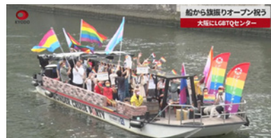
A cruise celebrating the opening of Pride Center Osaka

In this connection, the Osaka Convention & Tourism Bureau has created a comprehensive English-language website for LGBTQ travelers visiting Osaka. The site features introductory articles as well as information about restaurants and bars, and event listings.