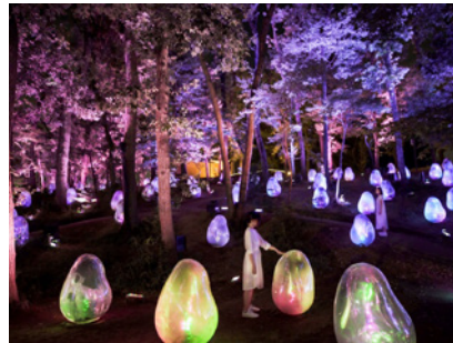
A botanical garden

In 2022, the Osaka Convention & Tourism Bureau established the Osaka Culture, Art, and Tourism Network. It consists of knowledgeable executives and experts from diverse fields who aim to boost tourism by improving access to Osaka’s cultural and artistic resources. Their activities include building informative websites and implementing social media campaigns targeting international students and other young people.