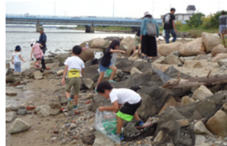
A cleaning event carried out as a part of the Osaka Blue Ocean Vision

Waste generated at business events, such as plastic bottles, is being recycled with the aim of achieving net zero waste.