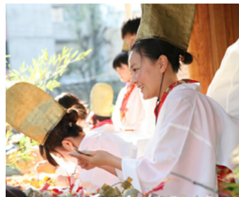
Imamiya Ebisu Shrine