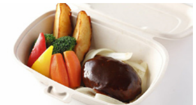
A compostable lunch box

Hotel New Otani Osaka is installing a rooftop garden and will introduce lunch boxes and cutlery made of dietary fiber that can be composted after use. Water-saving devices have been incorporated into all 525 guest rooms in the hotel, reducing typical water use by about 50%.