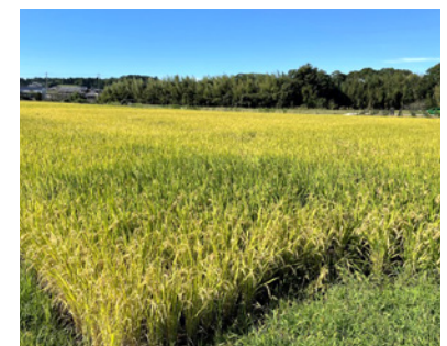
“Mie no Yume” rice

(2021 results: 50 tons of organic fertilizer produced from 85 tons of recycled garbage)