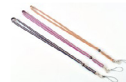
Lanyards featuring Sanada Himo cords

Initiatives of this kind offer participants a chance to experience Kyoto’s traditional industrial products and promotes their sale. This program adds to the satisfaction of organizers and participants, reduces waste by reusing products, and contributes to the SDGs.