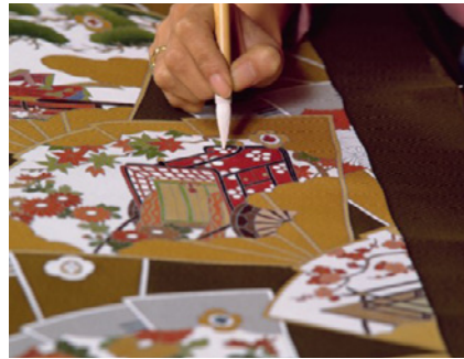
Kyo-yuzen dyeing experience

Kyoto offers comprehensive support for business events, tailored to type and scale. The Kyoto Culture for Meetings & Events Subsidy puts a special emphasis on preserving history and traditions. Programs in international conferences and incentive tours are eligible for a subsidy if they feature Kyoto’s culture and traditional industry, thereby offering participants an authentic Kyoto experience.