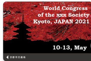
Kyoto Convention Pass

The Kyoto Convention Pass is a special discount ticket for international conference participants. It encourages participants to use public transport and contributes to reduced CO 2 emissions.