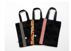
Bags with a traditional Japanese touch