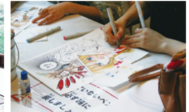
A manga experience