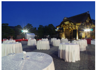
Nijo-jo Castle, a former Imperial villa

Kyoto’s unique venues include World Heritage sites, temples, shrines, and museums. Events in these spaces generate a special atmosphere that satisfies participants and contributes to more successful outcomes. Using these venues improves understanding of the city’s cultural assets and also contributes to their preservation. The Kyoto Convention Bureau offers comprehensive support by, for example, monitoring the status of each facility and helping organizers with introductions and arrangements.