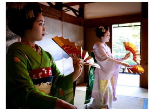
Folding fan dance experience

This initiative raises the city's appeal, improves people's lives, promotes business events and tourism, and contributes to the SDGs.