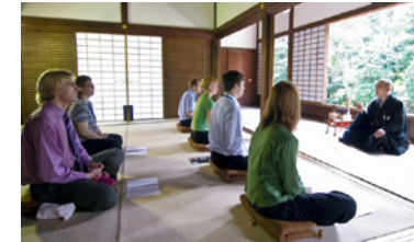
A Zen experience

Kyoto City and the Convention Bureau offer an excursion program based on five themes frequently requested by organizers: team building, community development, cultural experience, traditional industry, and networking. Specific themes include “Zen” and “manga.” These activities boost satisfaction among organizers and participants while contributing to the SDGs. A proportion of the income from these excursions goes towards preserving cultural assets and the environment, thus contributing to a better balance between everyday life and tourism.